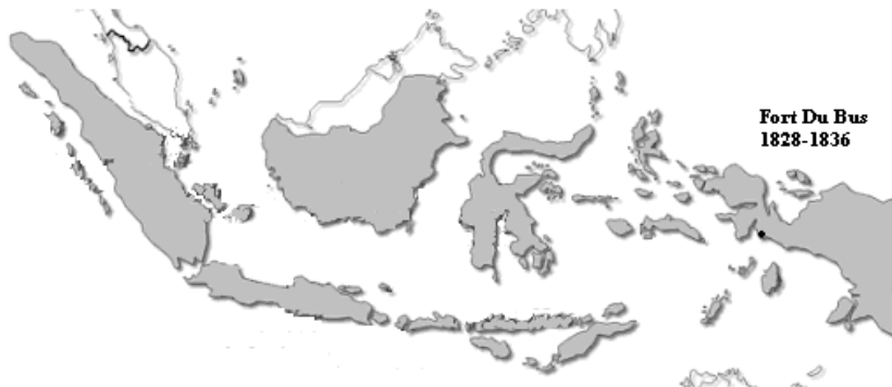
Figure 1: The position of Fort Du Bus in relationship to the Indian Archipelago.